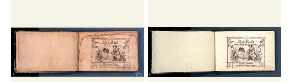
Fig. 5a and 5b