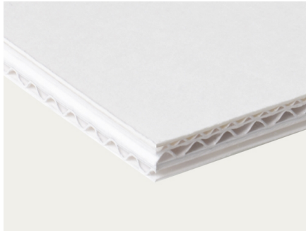
EBB 8.0 mm

Corrugated board – EBB 8.0 mm - 1735 gsm